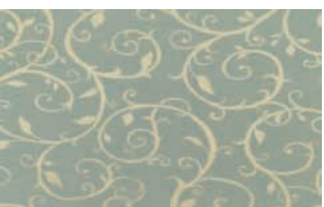
Cabaret Blue Haze